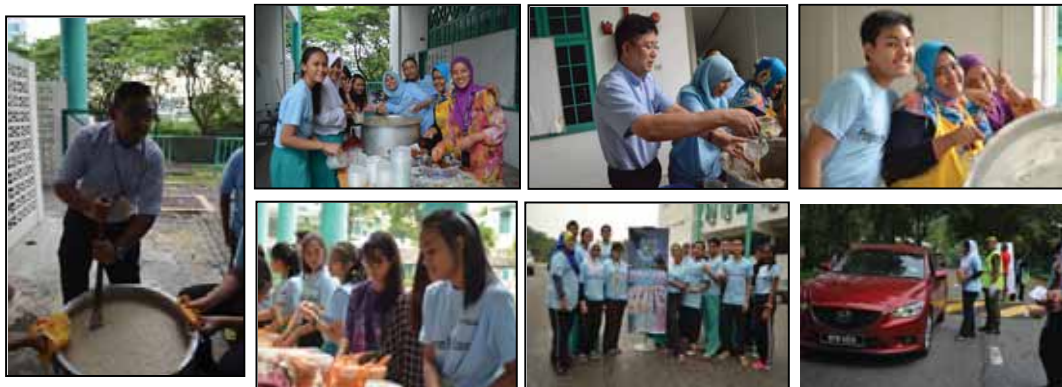
Staff and students hard at work

Program ini berakhir pada jam 6.30 petang. Pelajar-pelajar Islam dan beberapa pelajar bukan Islam yang sama-sama terlibat bersama-sama beberapa orang guru berbuka puasa secara sederhana di Sekolah Sri Bestari sebelum bersurai pada jam 8.00 malam.