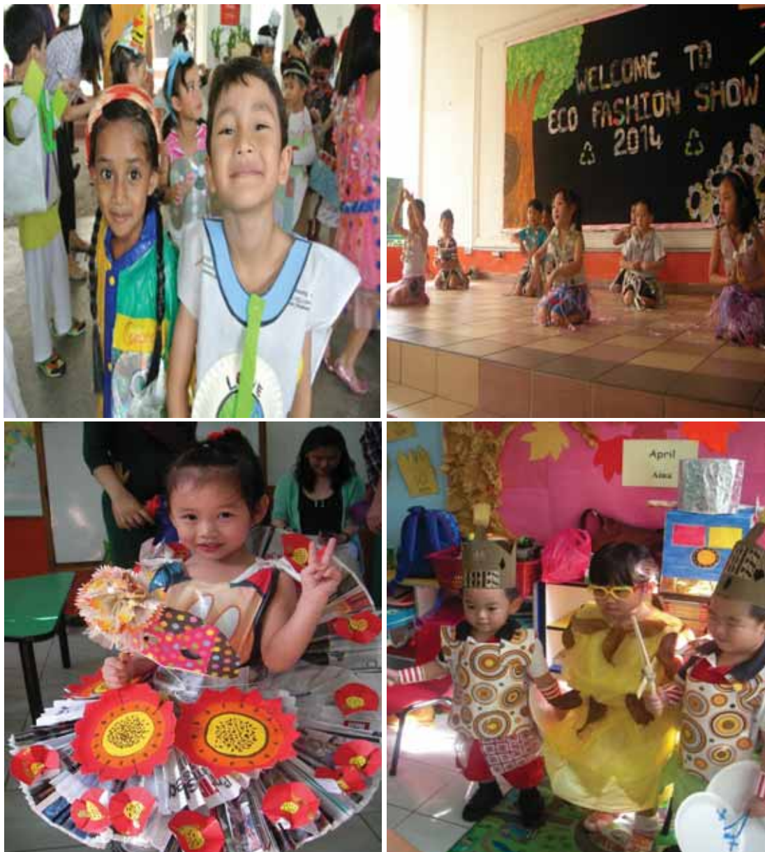
Students in their colourful costumes

The Eco Fashion Show was held on Friday, 4th July 2014. This event was organized to create awareness among the children about recycled items and how best we can reuse them for other purposes. We had a performance before the fashion show by each individual class and then followed by the parents dressing their children to their best. We would like to thank the parents for putting in much effort in this event and I am sure will be cherished by the children for a very long time. The competition to choose the best three costumes were very tough for the judges.