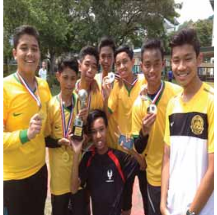
Pasukan yang menang: Brazil B15