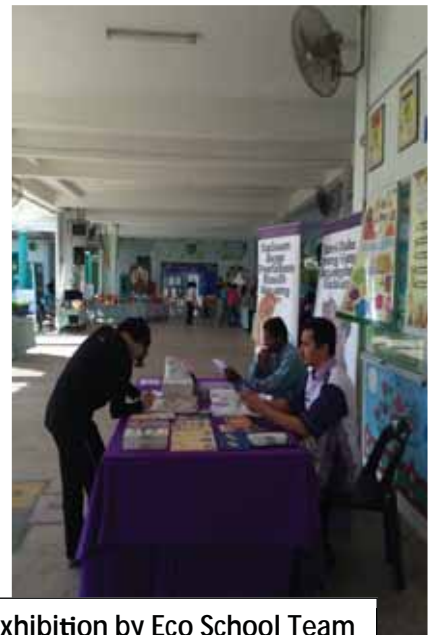
Eco Awareness Campaign & Exhibition by Eco School Team