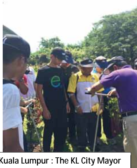
Bio-Pourri Demo at Taman Herba Kuala Lumpur : The KL City Mayor trying the tool to make the bio-pourri hole supervised by SSB Eco