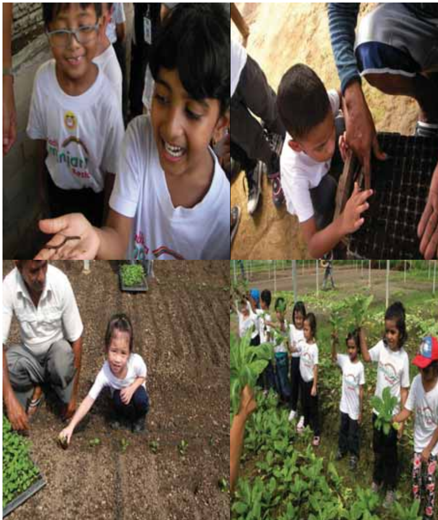
Students exploring Organic Farming

The organic farm trip which was on Monday, 19 th May 2014 was the first trip organized for this year. 82 percent of the children participated in the trip. The children looked forward to the trip because they had a planting session in the school before the trip and when they were at the farm they were able to see planting in a bigger scale and experienced harvesting as well to which the children enjoyed immensely. Lunch was at children's favourite restaurant - McDonald's.