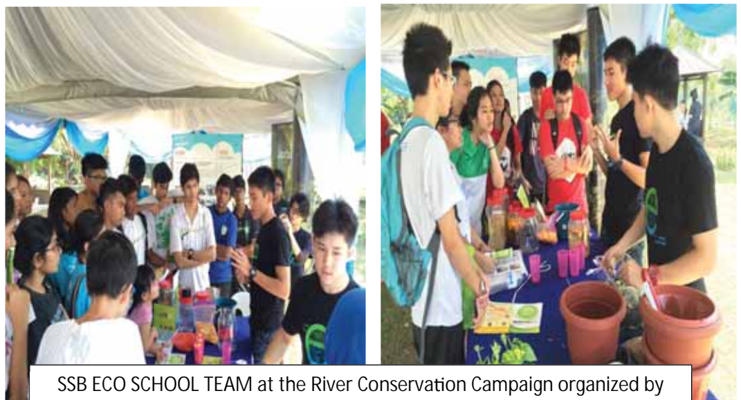
SSB ECO SCHOOL TEAM at the River Conservation Campaign organized by the Rotary Club, Petaling Jaya