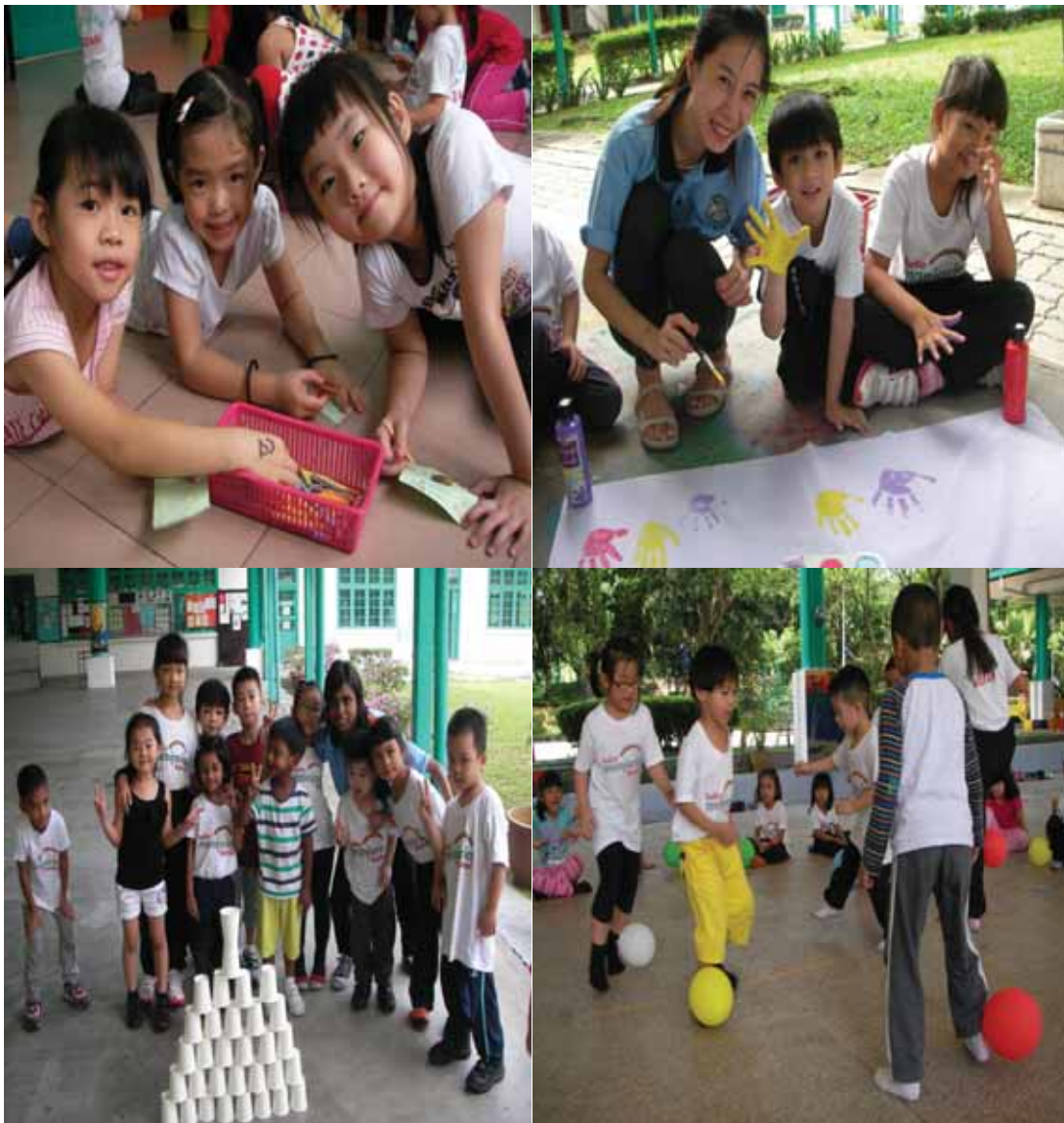
Fun and games at the Summer Camp

The Summer Camp which was held from 2 nd until 6 th June 2014 during the Mid Term School break was a success with 53 participated in the event. The children had to work in teams doing art work and other activities which the teacher's themselves admitted was great fun but a little tiring .