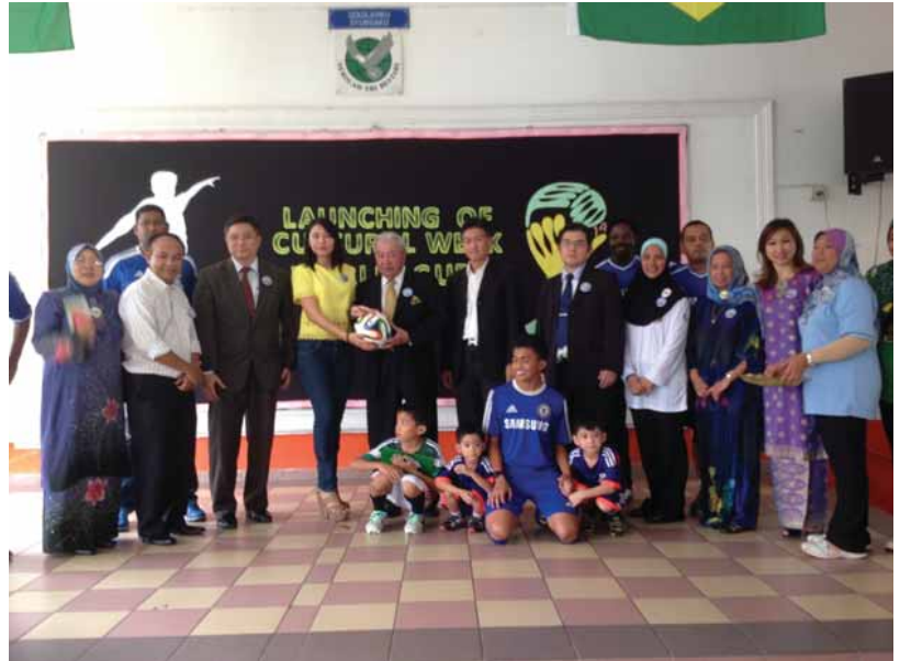
The Honorary Consul of Portugal launching the Cultural Week.