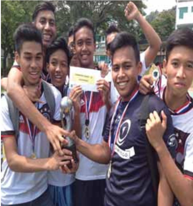
Pasukan yang menang: Jerman B18