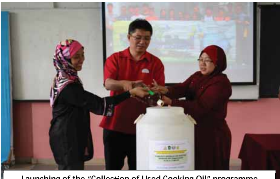
Launching of the "Collection of Used Cooking Oil" programme