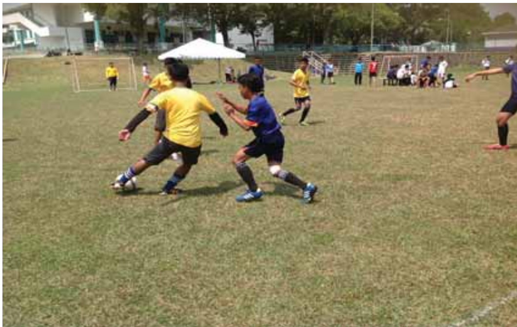
Pasukan Brazil menentang Pasukan Belanda pada perlawanan akhir