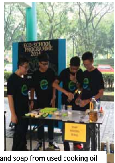
Demo : making scented candle and soap from used cooking oil