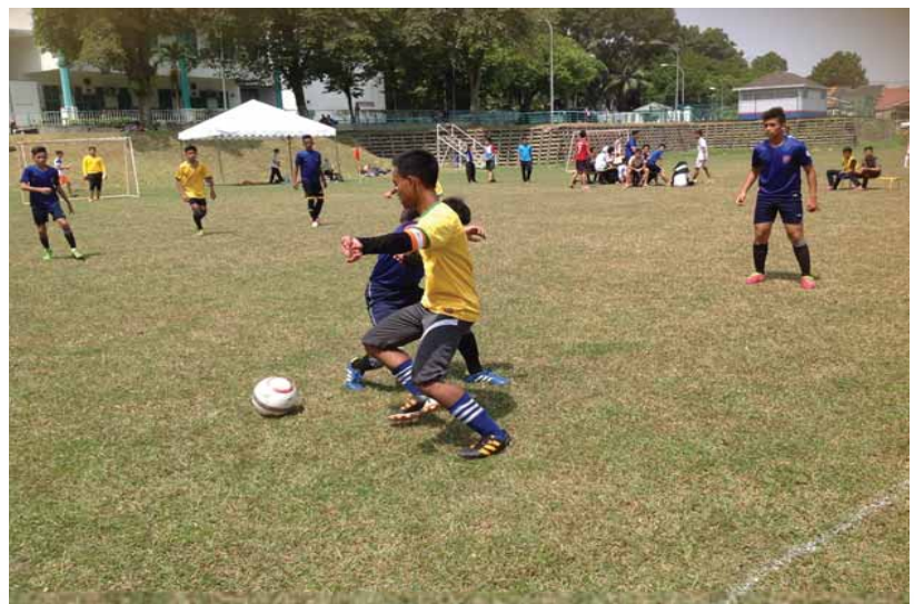
Battling out for the 5 on 5 football tournament on Saturday in conjunction with the Cultural Week.