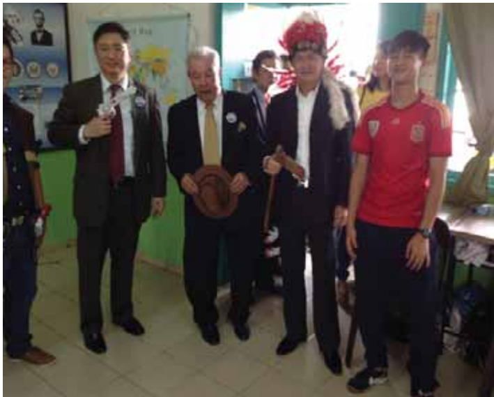
The invited guests visiting 5 Business which represented the United States of America.