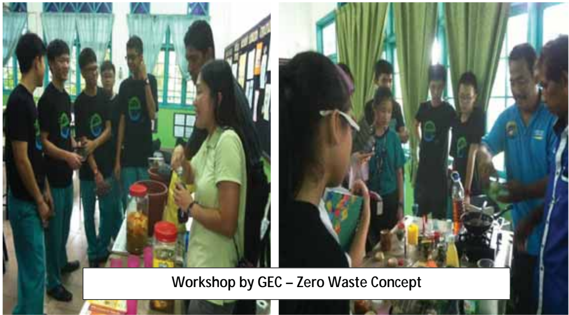
Workshop by GEC – Zero Waste Concept